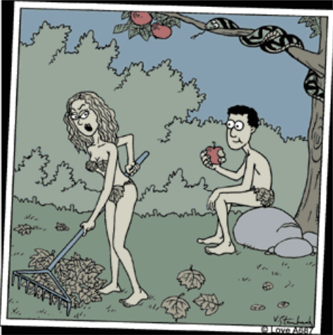
"I'm getting awfully tired of raking up your underwear."

Listen online at www.callithome.org 'Sermons'